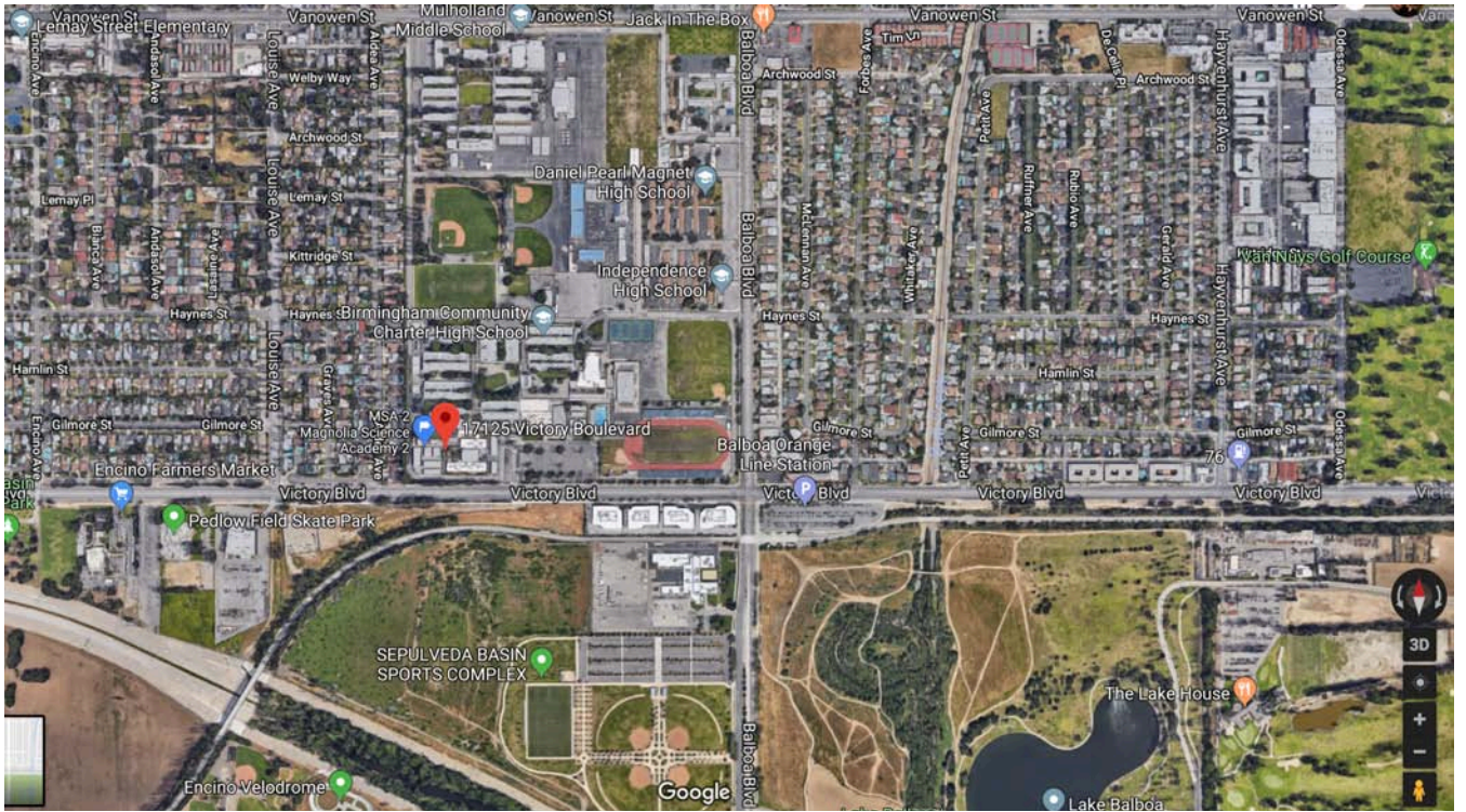
EXHIBIT A MAP OF SCHOOL LOCATION